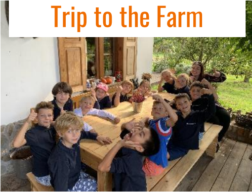
Trip to the Farm